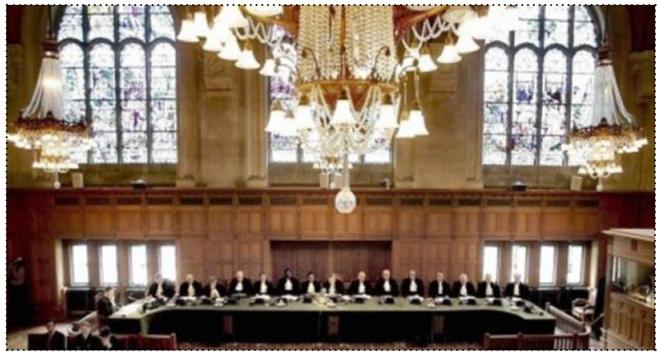
Permanent Court of Arbitration in Hague