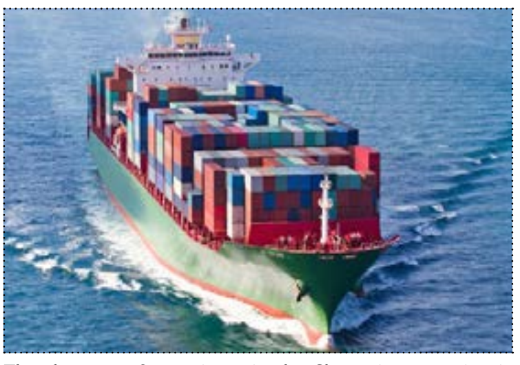
The shortage of containers in the Chennai port region is around 25 per cent compared to the usual stocks.

With pandemic decline container availability and prices expected to stabilize