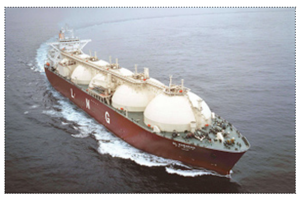
LNG Carrier AL ZUBARAH

As MOL forges ahead to become the world leader in safe operation, it continually strives to contribute to marine safety MOL and conservation of the global environment, as a synergistic, sustainable company that grows in harmony with society.