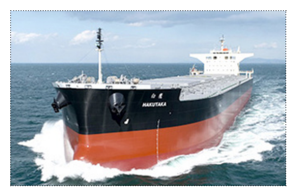
Bulk ship HAKUTAKA