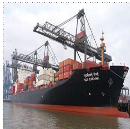
For SCI strategic disinvestment 4 companies invited to bid

The remaining equity of the BSE-listed company is held by the public.