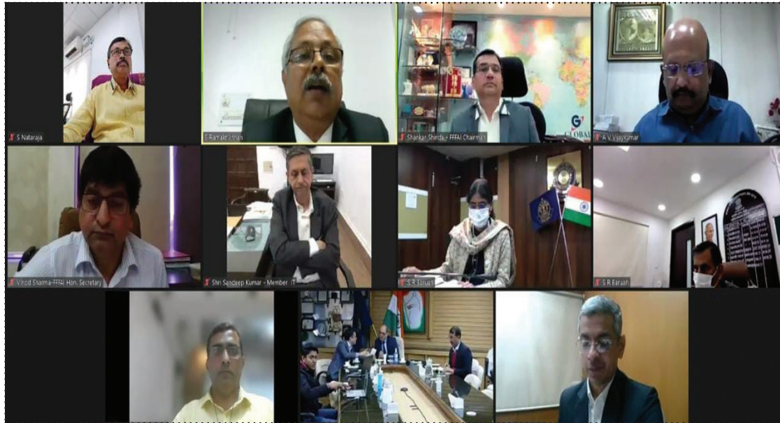
Webinar on Initiatives and Changes made in the DG System

continuous efforts towards trade facilitation, especially during COVID-19 pandemic time.