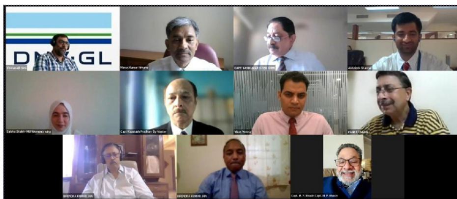
CMMI Team &amp; Participants

A large number of key participants from manning offices, maritime institutes, and the sea staff attended the webinar, these included participants from MSC, Seaspan, AESM, ARI, MMTI, TMI, Fleet, Synergy Maritime, MUI, and others.