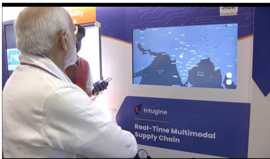
Demonstrating Intugine Multi Modal