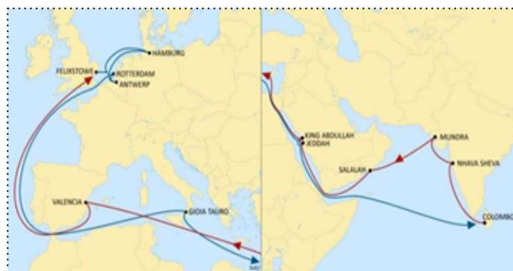
MSC Himalaya Express Service added with Port of Jeddah

The first ship sailing from India to Jeddah will be MSC IRENE on