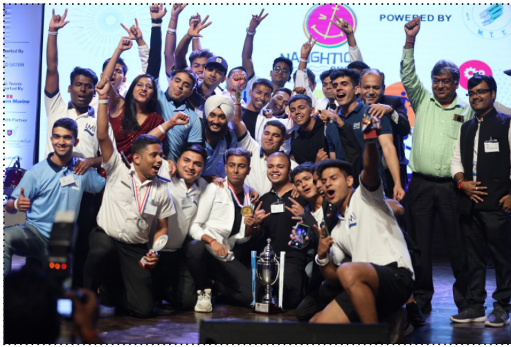
IMI Runner Up's Medal Tally