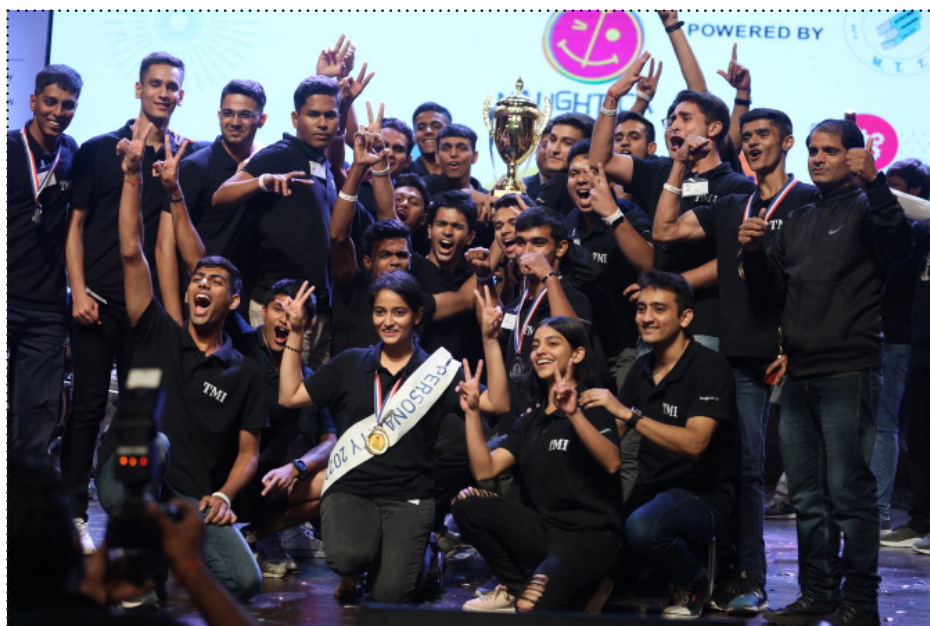
TMI Winner Medals Tally