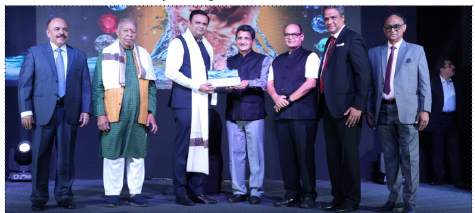
Shri Rahul Narvekar being honored