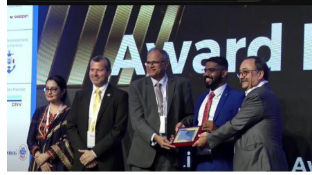
Champion of Diversity Award