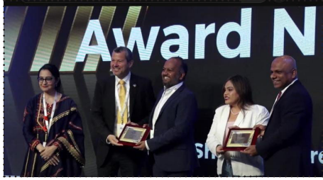
Entrepreneur of the Year Award