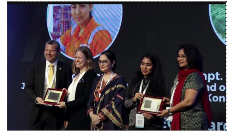
SheEO to Watch Out For Winner Award