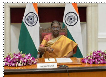
President Droupadi Murmu

Defense Minister Rajnath Singh, Governor Biswabhusan Harichandan