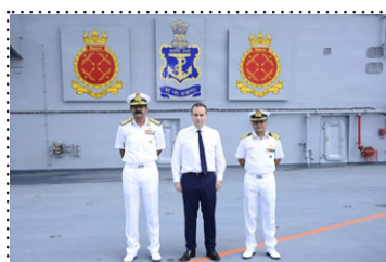
French Minister's visit to INS Vikrant

their country's minister for Armed Forces Mr. Sébastien Lecornu, visited the Indigenous Aircraft Carrier INS Vikrant.