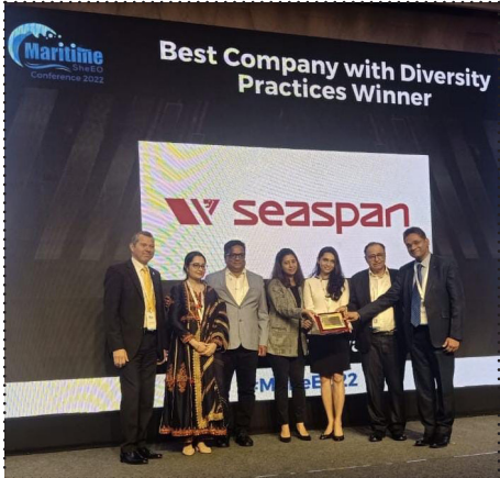
Seaspan-Best Company with Diversity Practices Award