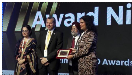
TradeWinds-Media Company of the Year Award