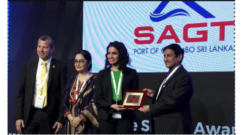
SAGT-Best Company with Sustainable Practices Award