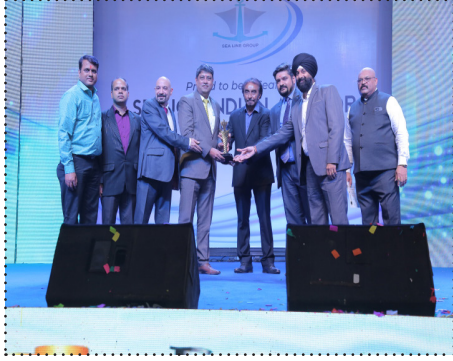
MSC Crewing Services- Best Employer of the Year-SC