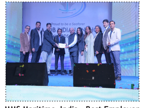
MMS Maritime India - Best Employer for Chemical Tanker Fleet-SC