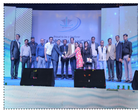
TW Ship Management - Best Employer for Container Fleet - SC