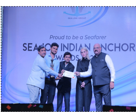
Sinasta Maritime- Company with max all type vessels-PC