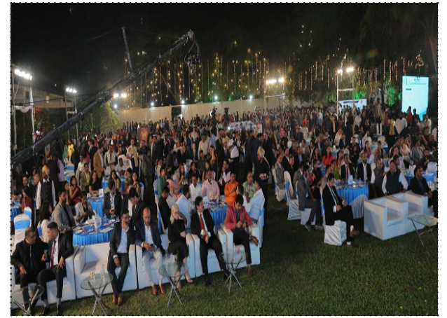
Maritime Industry August Gathering

The Guests are overjoyed with Bollywood songs /DJ and Cocktails followed by a Multi-cuisine Dinner.