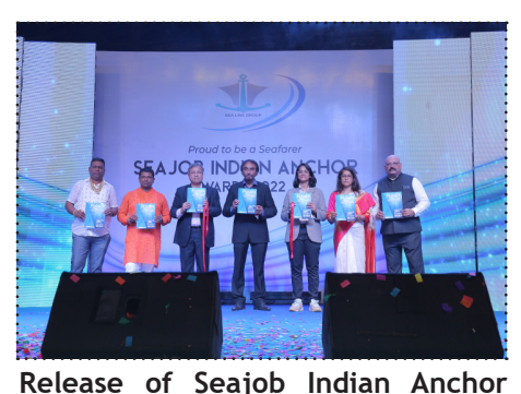
Release of Seajob Indian Anchor Awards 2022 Magazine