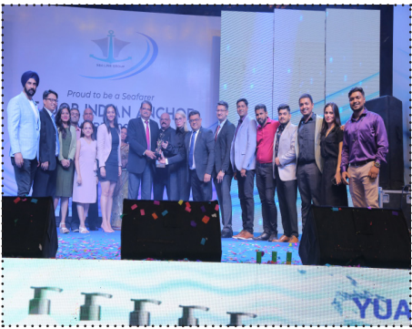
MTM Ship Mangmnt India- Best Employer of the year- PC