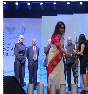
Lighting of Lamp

the sponsors. The event began with the lighting