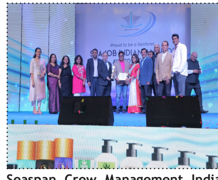
Seaspan Crew Management India- Fastest Growing Company of the Year-SC