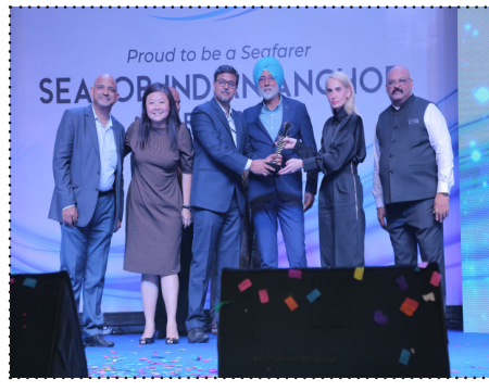
Eastaway India- Best Employer for Container Fleet- PC