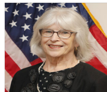
US Mission India Charge d'Affaires Ambassador A Elizabeth Jones

The Solar panel manufacturing facility of First Solar Inc, set up with the support of the United States in Sriperumpudur near Chennai would help India meet its climate target and reduce dependence on