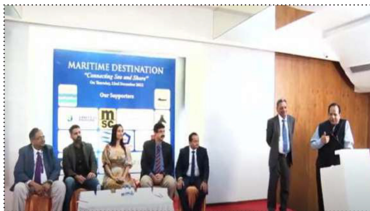
Panelists &amp; Moderators