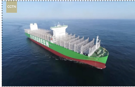
MV Ever Alot. The ship, with a carrying capacity of 24,004 TEU, was delivered by China's Hudong-Zhonghua Shipbuilding in June, becoming first ship in the world to crack the 24,000 TEU mark.