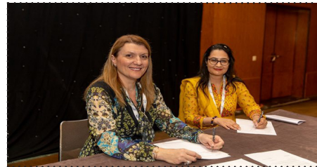
WISTA International and the Maritime SheEO announced the start of the formal partnership in November initiating the second Maritime SheEO Leadership Accelerator Programme