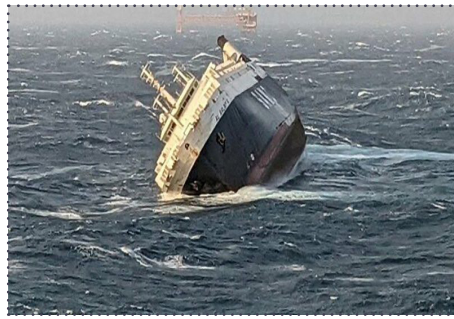
The Emirati ship Al Salmy 6 is seen sinking 30 miles from Assaluyeh in the Persian Gulf, Iran, March 17, 2022.