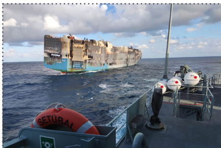
Felicity Ace badly burned and listing. Felicity Ace sank on March 1, 2022-220 nautical miles off the Azores 2 weeks after suffering fire and developing starboard list while carrying 4000 vehicles.