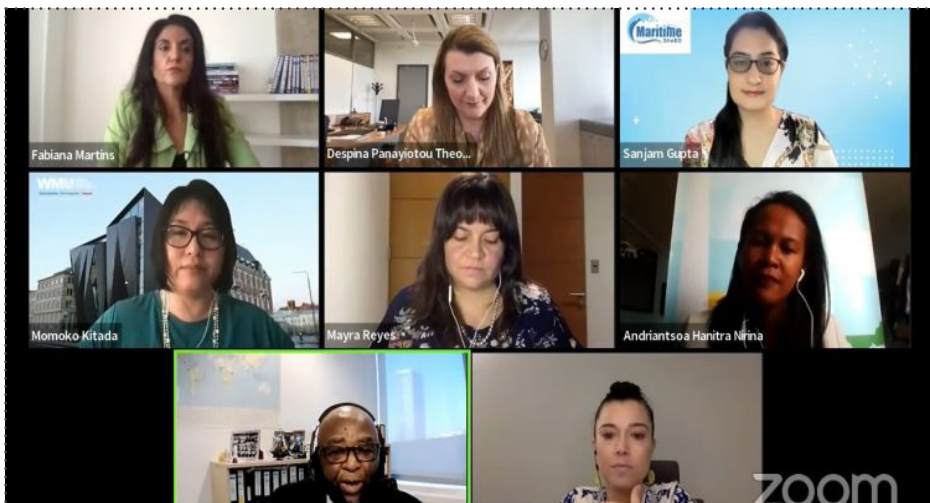
On March 8th IMO in collaboration with WISTA International and Maritime SheEO announced launch of the Maritime SheEO Leadership Accelerator Programme 2022