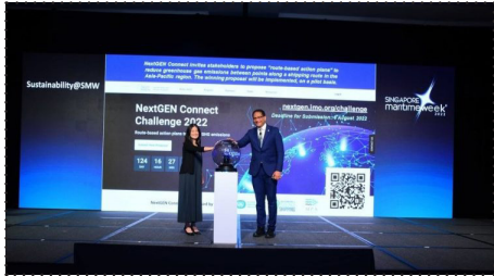
MPA Singapore and IMO jointly launched NextGEN Connect- a database which aims to bring stakeholders and academia and global research centers together to offer solutions on maritime decarbonization