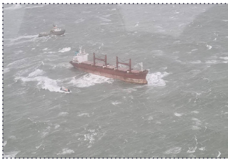
Photo showing the Julietta D abandoned and adrift off the Dutch Coast. The bulk carrier was rescued after a dramatic 24-hour rescue and nearly running aground during Storm Corrie in late January