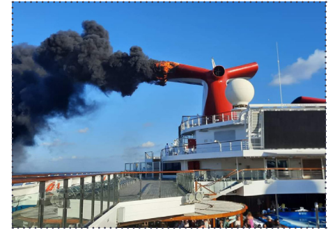
A fire burns in the funnel of the Carnival Freedom while docked at Grand Turk Island in Turks and Caicos May 23-The incident entertaining viral videos as the fire burned, guest continue to party