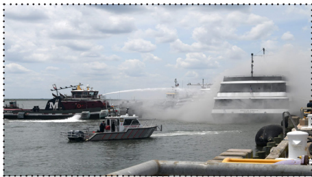
Tugboats spray water on the Spirit of Norfolk passenger vessel after a fire broke out near Naval Station Norfolk in Norfolk, Virginia, June 7, 2022. The sightseeing vessel was on a cruise on the Elizabeth River near Naval Station Norfolk when it caught fire with 108 people on board, many of whom were school children on a field trip.