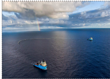
The Ocean Cleanup's System 002 deployed in the Great Pacific Garbage Patch. The largest and most ambitious ocean cleanup project in history in July by removing its first 100,000 kg of plastic.