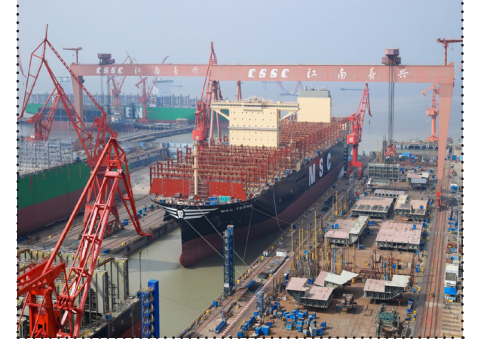
MSC Tessa under construction at Hudong-Zhonghua Shipbuilding. With a carrying capacity of 24,116 TEU, MSC Tessa will surpass Evergreen's Ever Alot by 112 TEU to take the title of world's largest Con.