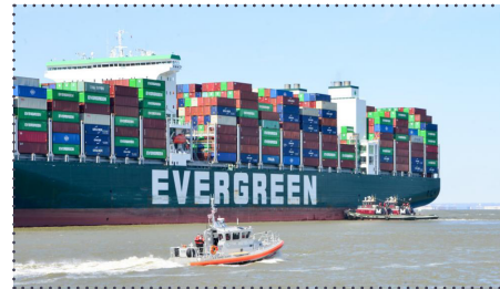
A 45-foot Response Boat-Medium underway alongside the grounded container ship Ever Forward in the Chesapeake Bay. The 1,095-foot ship grounded back in March outside the main shipping - stuck over month