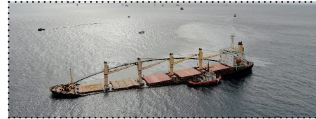
A view of the half-sunk cargo ship OS 35 in Catalan Bay after its collision on Wednesday with an LNG tanker near Gibraltar, September 1, 2022. The bulk carrier partially sank and later broke off.