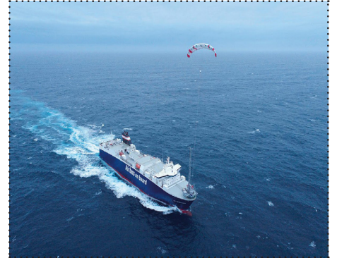
The roll-on/roll-off ship Ville de Bordeaux trials Airseas' new "Seawing" automated kite system during a transatlantic voyage between Europe and the United States in December 2022.