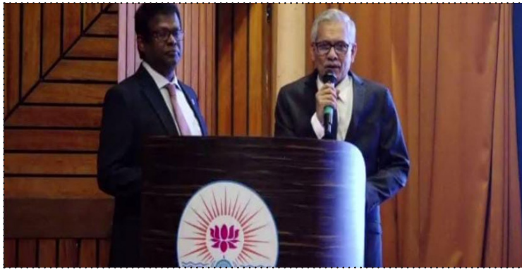
Group 3 Consideration and Adoption of Amendments to Mandatory Instruments