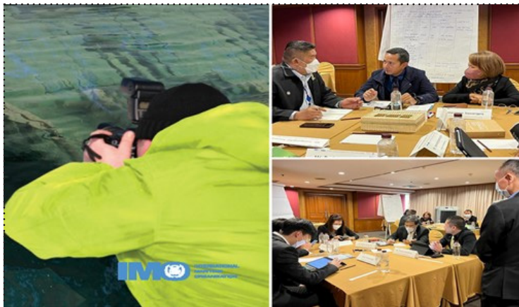
The five-day national training course is for officers from Thailand's Marine Accident Investigation Office (MAIO)

Joining the Foundation Course remotely, the IMO Representative highlighted