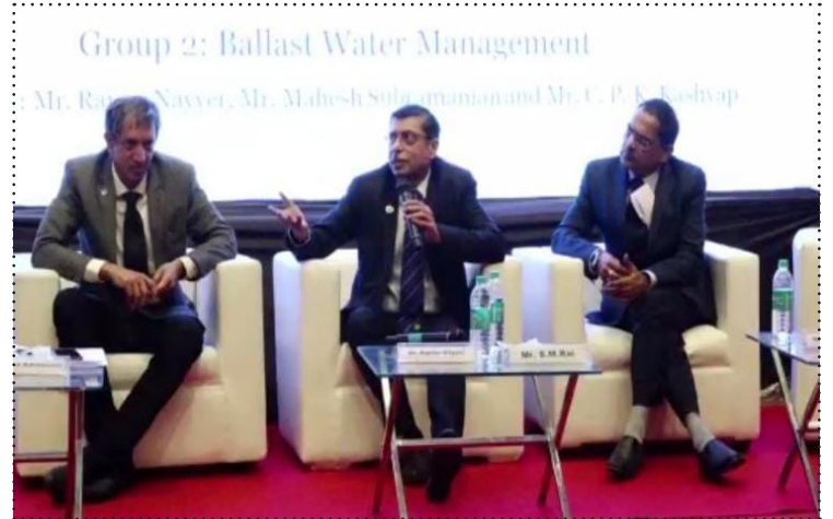
Group 2 Ballast Water Management