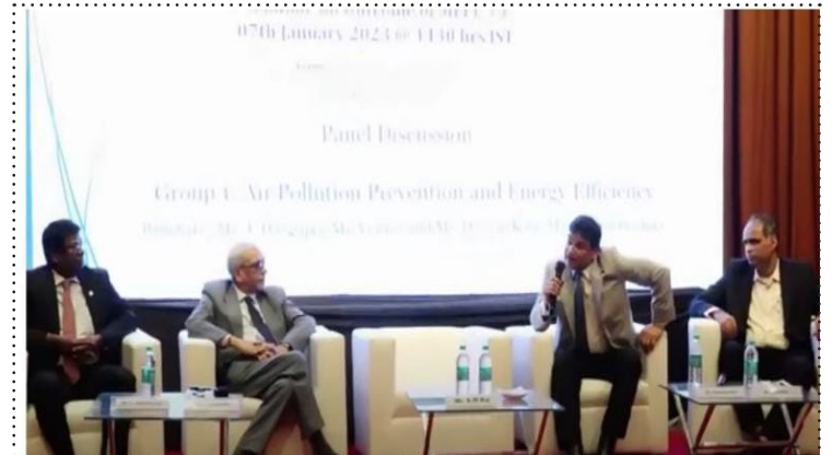
Group 1 Air Pollution Prevention and Energy Efficiency.