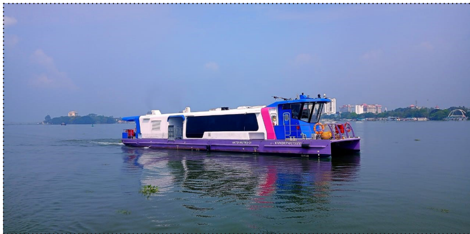
Water Metro - 01 _ Hybrid Ferry

I ndian Register of Shipping (IRS) has recently classed a hybrid catamaran (battery powered) ferry - 'Water Metro-01'. It is the first in a series of 23 such vessels being built by Cochin Shipyard Ltd. As decarbonisation gathers pace, industry stakeholders are actively working together to develop alternate propulsion systems with an aim to reduce overall carbon footprint.