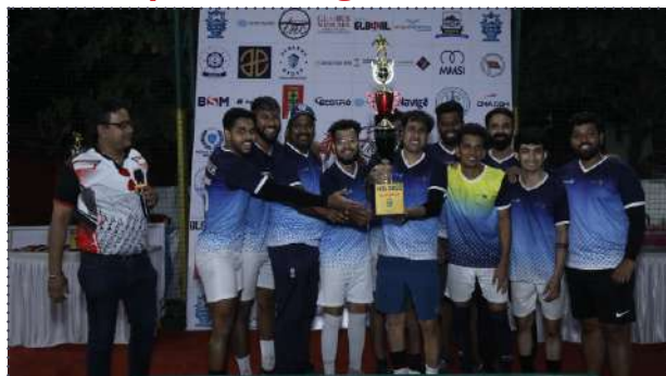
Runner Up - Elegant Marine