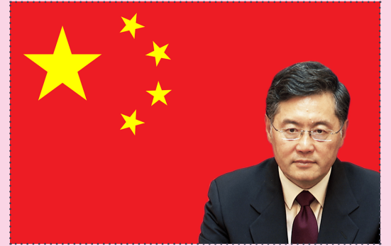
China's New Foreign Minister, Qin Gang

China claims nearly the entire South China Sea but that claim is disputed by several Maritime neighbors including