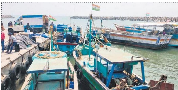
Fishermen pool their money and construct their own harbor.

The project was executed on a priority basis after violent clashes erupted between residents of the fishing hamlet and neighbouring Akkaraipettai