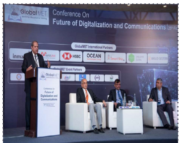
Panel II - Crewing Challenges for Digitalisation