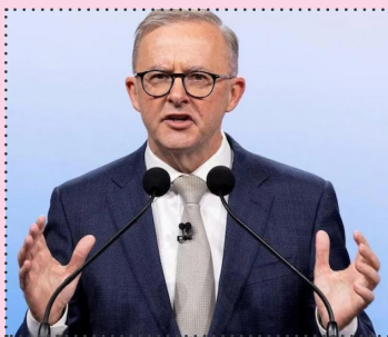
Australian Prime Minister Anthony Albanese

Australian Prime Minister has described India as a top tier security partner and emphasized that Indian Ocean region was key to the security and prosperity