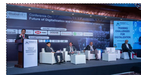
Session III Panel I - Training Challenges for Digitalisation