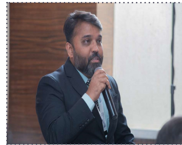
Capt. Chinna GM IMTC exchanging views among members through Panel Sessions

the future and challenges of digitalization along with Training and Crewing challenges faced with the upcoming digital age. The panelist shared and opened the forum bridging the gaps with suggestions on the solutions for Government and Private bodies to take up in their scheme of things. With digitalization being the future of ship management, the conference set the bar in formulating a common stand on issues of interest related to Maritime education, training, research, and development.