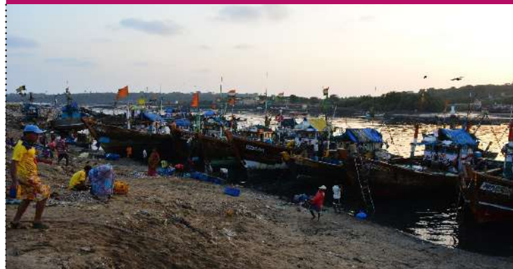
Fishing harbor at Versova beach

We can't afford to lose more of it according to environmentalists.