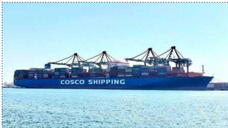
Methanol supply to fleets of CMA CGM and COSCO SHIPPING