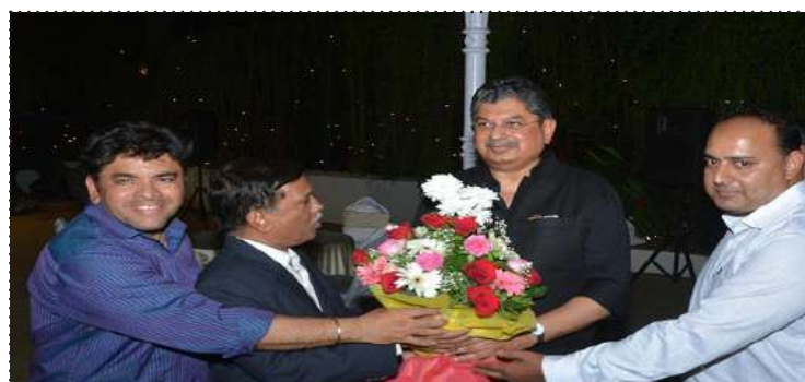
Bouquet of Flowers to Shri Amitabh from NUSI & MUI Rep