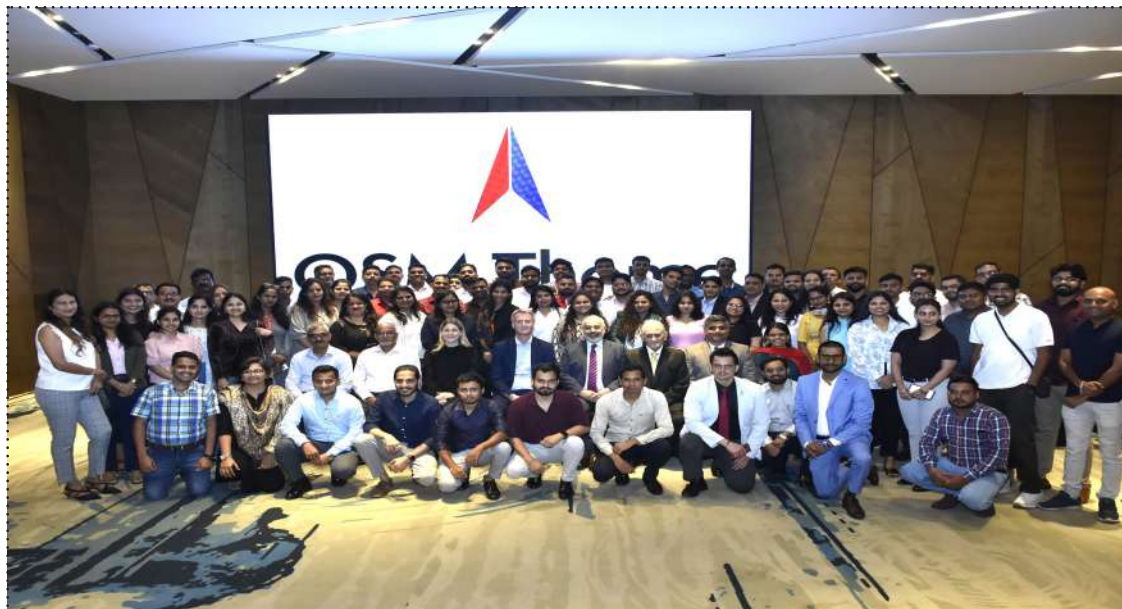
OSM Thome Mumbai Team