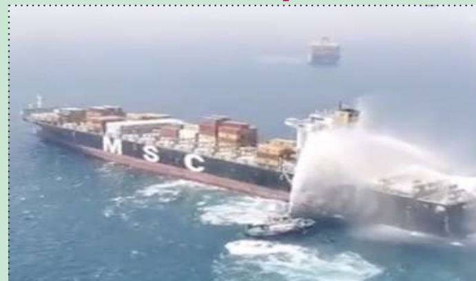
A MSC Mediterranean Shipping Company containership has caught fire at an anchorage in the UAE.