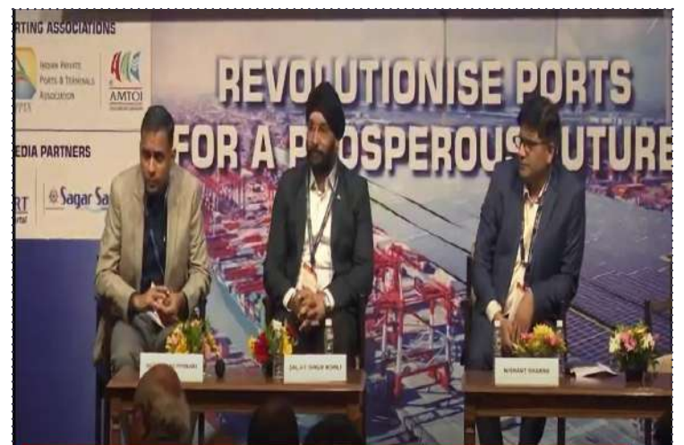
Session 3 Presentation-Green Initiatives and Implementation Status