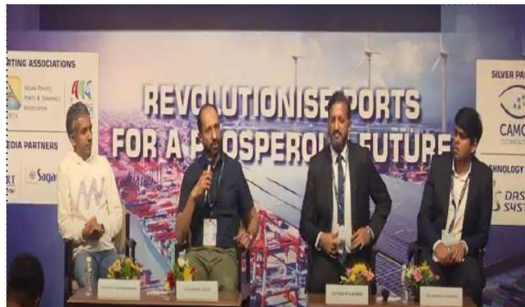
Day 2 Session 5 Panel Discussion-Coastal Shipping & Inland Waterways, Green Fuel & National Green Corridors