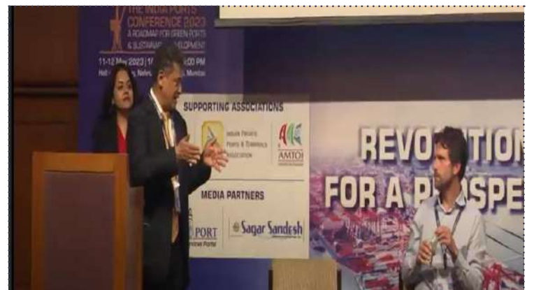
Session 4 Presentation- Evolving Technologies in Port Operation, MC at podium