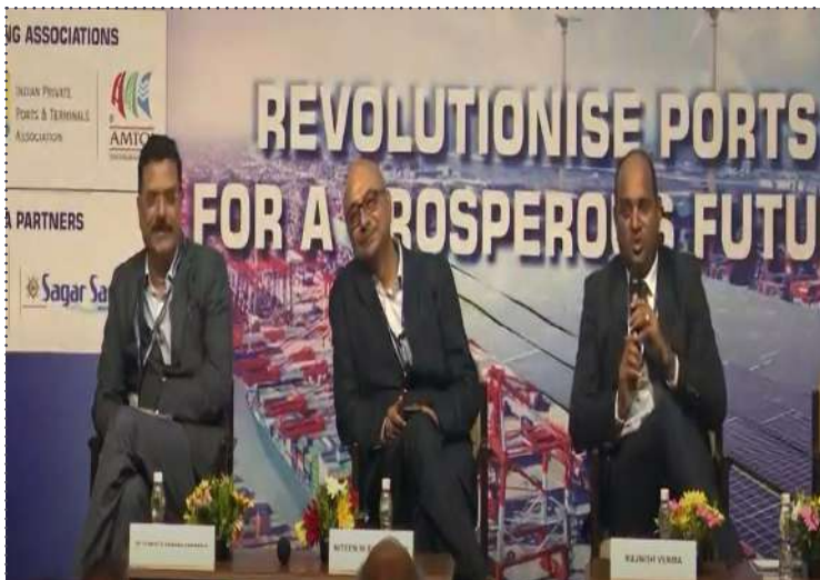
Day 2 Session 2 Presentation-Practical Insights into Shore Power Projects