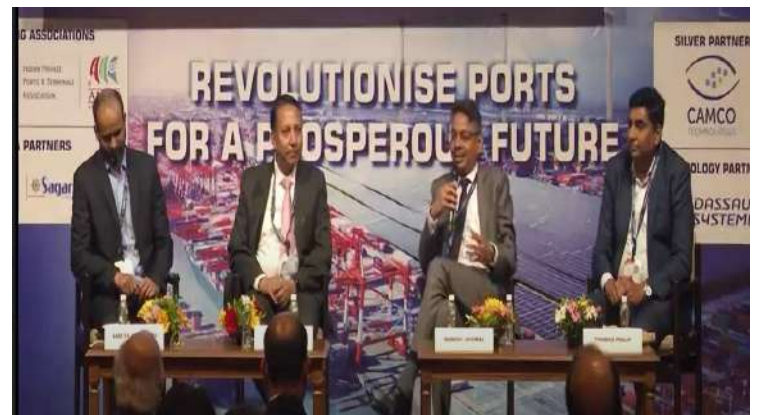
Session 2 Presentation- Maritime Single Window & National Logistics