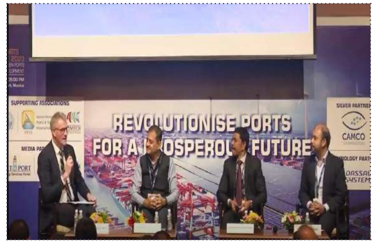
Session 1 Panel Discussion-Reinventing Port Models for Green Business