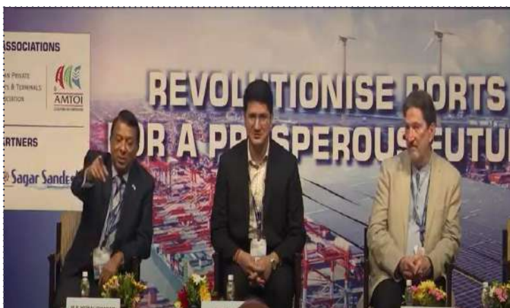
Day 2 Session 3 Presentation- Cyber Security,Securing your Ports and Terminals