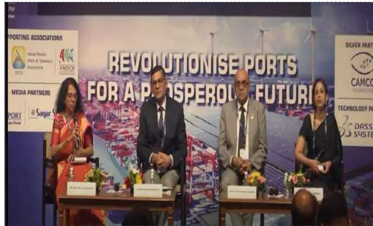
Day 2 Session 4 Panel Discussion-Investing in Human Capital to Drive Digitisation