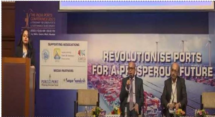
Day 2 Session 1 Presentation-Future Fuels - Sourcing Green Power for Ports-MC at Podium