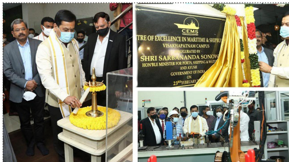
CEMS Inauguration- Shri.Sarbananda Sonowal

A one stop comprehensive training centre for imparting high end training in latest software & hardware technology aiming to transcend designing & manufacturing processes to Industry 4.0 levels, to enhance productivity and optimize production costs.