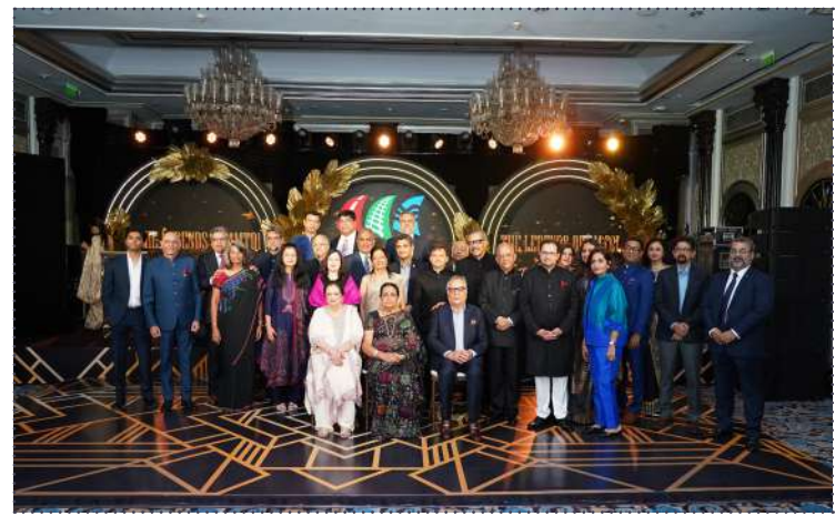
Legends of AMTOI