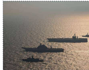
Malabar exercise 2022

incidentally has grown in India's north-east with the Myanmar's military government remaining neutral. Despite the presence of Chinese nationals and infrastructure upgrade in Coco Islands in Bay of Bengal, the Myanmar government denies any Chinese involvement. Coco islands are situated just north of Andaman islands.