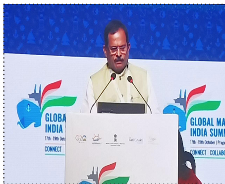
Shri Shripad Naik

India holds a strategic position in global trade. The country has made impressive strides under transformative initiatives like Sagarmala and the Prime Minister's Gati Shakti National Master Plan, which have modernized port infrastructure, enhanced connectivity, and facilitated port-led industrialization."