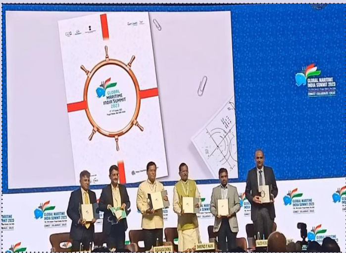
Unveiling of the official GMIS 2023 brochure

The curtain raiser concluded with the unveiling of the official GMIS 2023 brochure and the launch of the event's website and mobile app to provide a comprehensive overview of the summit's agenda and thematic sessions and will serve as essential resources for participants.