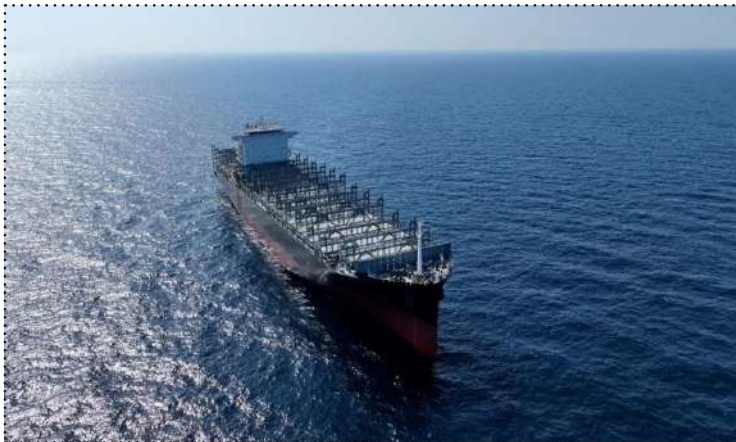
MH Perseus-Eastaway Ship Management Singapore

S hanghai Waigaoqiao Shipbuilding (SWS), a part of China State Shipbuilding Corporation (CSSC), has delivered the third and fourth eco-friendly 7,000 TEU containership to Singapore-based shipowner X-Press Feeders. As informed, the vessels MH Pegasus and MH Perseus were delivered