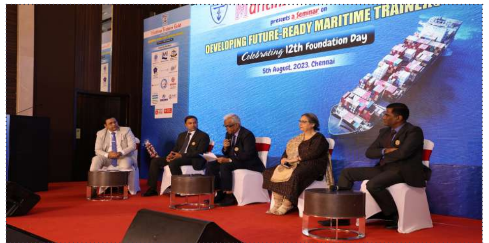
Panel Discussion on Developing Maritime Trainers of Tomorrow

Three Panel discussions were organized highlighting the necessity of adapting training methodologies to align with technological advancements, industry shifts, and the expectations of the next generation of seafarers. The discussions emphasized the significance of embracing Information and Communication Technology, collaborative learning, continuous professional development, and practical relevance in shaping the