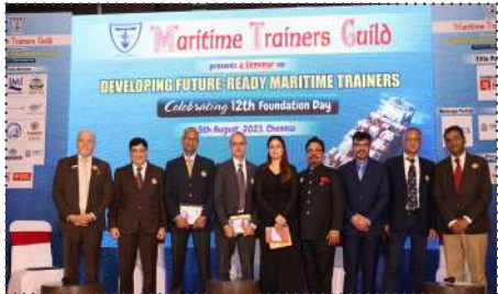
MTG Team with Panel Discussion members on topic- Developing Maritime Training to Cater to the Next Decade

The Maritime Trainers Guild Foundation Day Event served as a significant platform for stakeholders in the maritime industry to collectively address the challenges and opportunities in