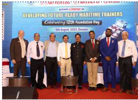
MTG Team with Panel Discussion member on topic- Courses in which online & blended training will be effective.

maritime trainers of tomorrow. The event's deliberations have set a positive trajectory for the evolution of maritime training in the coming decade, ensuring that maritime professionals remain equipped with the skills and knowledge required for a rapidly changing industry landscape.