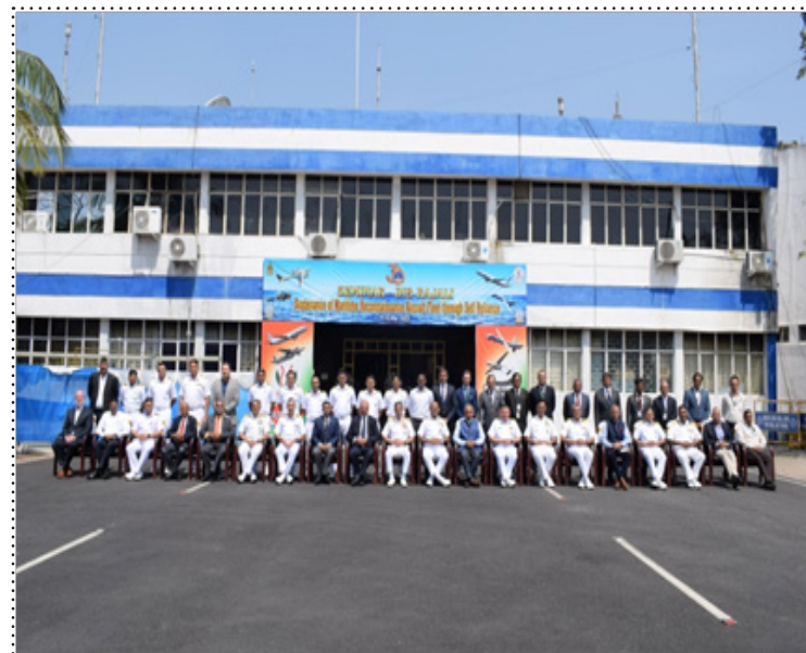
INS Rajali completes 30 years of its service to the nation

Mar 22 respectively. INS Rajali was commissioned on 11 Mar 92 and has been the abode for the Long Range Maritime Reconnaissance Aircraft Squadron (INAS 312) and Helicopter Training School (INAS 561). The air station has the unique distinction of operating the state-of-the-art Boeing P81, Sea Guardian High Altitude Long Range (HALE) Remotely Piloted Aircraft (RPA) along with legacy vintage Chetak Helicopters.