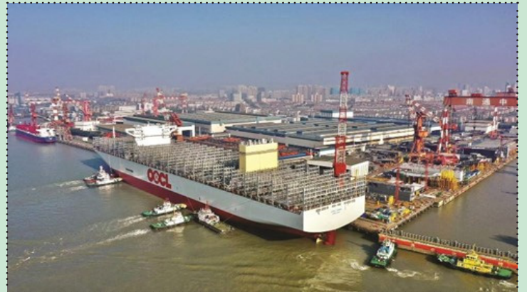
Hong Kong-based container shipping company Orient Overseas Container Line (OOCL) held the naming ceremony of a 24,188 TEU newbuilding at Dalian COSCO KHI Ship Engineering Co (DACKS) shipyard

These ships from the 24,000 TEU series are capable of carrying up to 24,188 twenty-foot container boxes, firmly establishing them among the world's largest container ships, measured by their carrying capacity. They exhibit impressive dimensions, with a total length of 399.99 meters and a width of 61.3 meters.