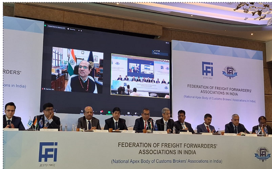
FFFAI Office Bearers during address of the CBIC Chairman on virtual platform on 60th AGM