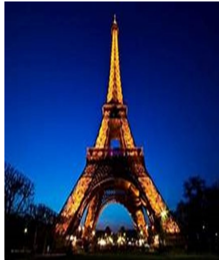
Popular icon for France; Eiffel tower, Paris

France has laid claim to its interests in the Indian Ocean