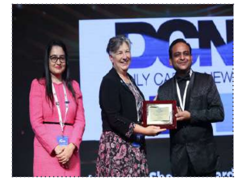
The Daily Cargo Award for Media Company of the Year Award recd in proxy