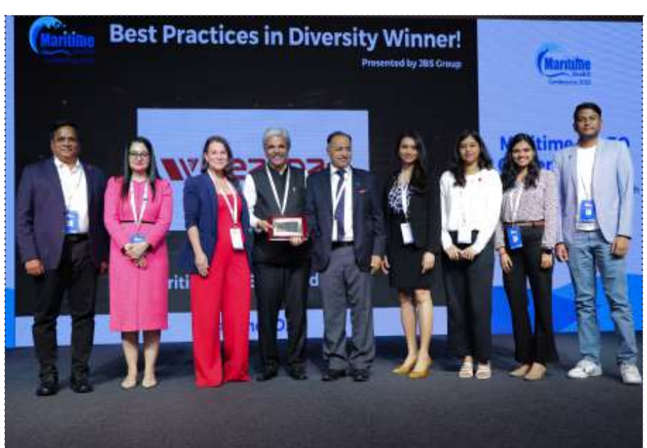
Seaspan Corporation for Best Practices in Diversity