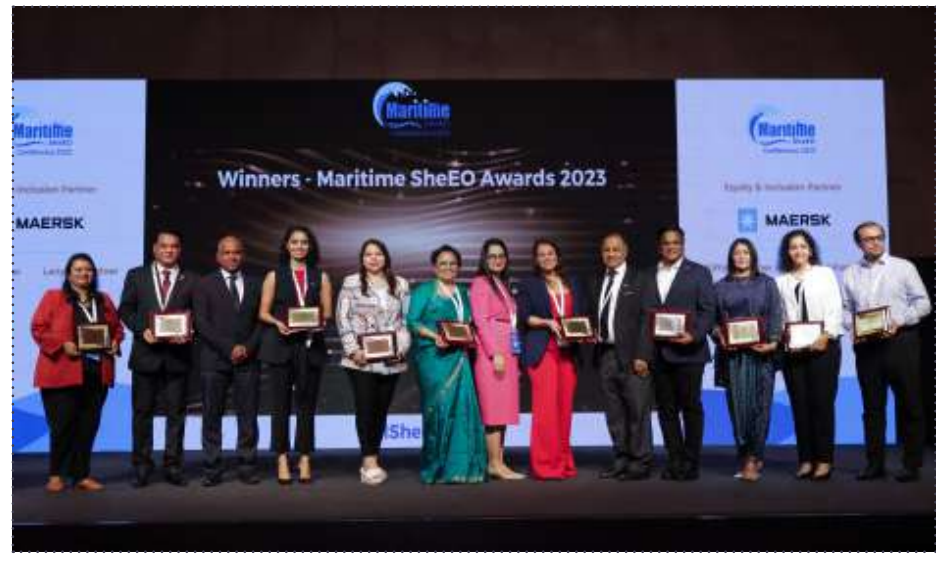
Award Winners of Maritime SheEO 2023

carry the lessons learned and the connections made. Let us all be ambassadors of change, advocating for diversity in every interaction and decision we make. The real impact of this conference lies not just in the discussions we've had, but in the actions we take henceforth. Diversity is not just a destination, but a journey – it requires unwavering commitment and a shared responsibility."