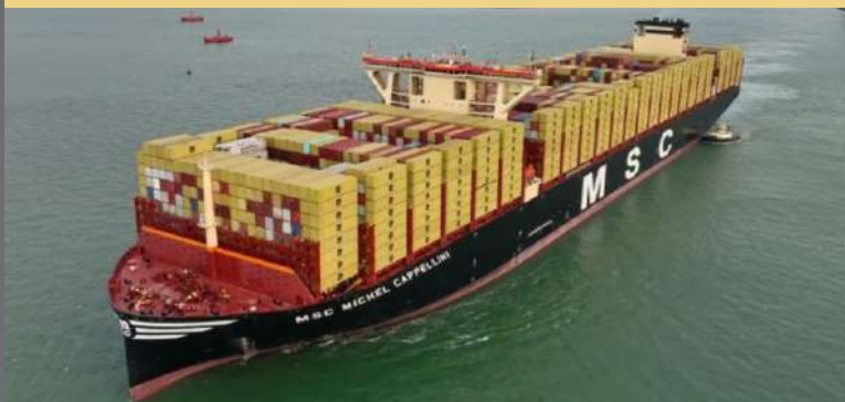
MSC is very proud to takeover world's Largest container vessel MSC MICHEL CAPPELLINI – 24,346 TEU, fully manned by INDIANS

Kolkata - Tel: +91 33 40393402/03/08 Email : kolkata@msccs.com