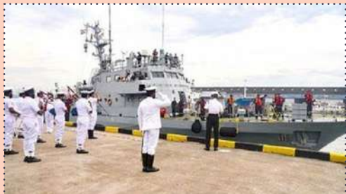
INS Kabra docks at Colombo port

A fast attack ship of the Indian Navy visited Sri Lanka, in reflection of growing maritime security cooperation between the two sides. Fast Attack Craft INS Kabra arrived at Colombo Port on January 8th