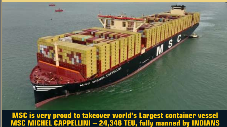
MSC is very proud to takeover world's Largest container vessel MSC MICHEL CAPPellini – 24,346 TEU, fully manned by INDIANS