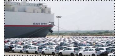
Largest auto-hub planned in Abu Dhabi

The Regional Auto Hub – Abu Dhabi, according to Kizad, a leading industrial hub and a subsidiary of Abu Dhabi Ports, will be one of the region's largest,