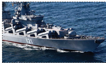
Russian warship Moskva

The NGO Human Rights at Sea says that Russian attacks on merchant ships are war crimes. One Russian warship that won't be taking part in any more such attacks any time soon is the flagship of its Black Sea Fleet, the guided missile cruiser Moskva.