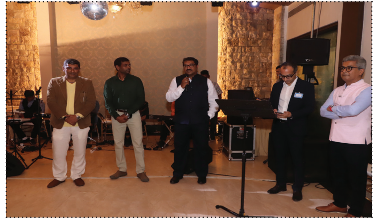
Qatar Airway Team appreciating ATPI and Industry.

In September 2017, the ATPI Group announced that the company had joined forces with Direct Travel, a leading provider of corporate travel management services, to form Direct ATPI – a