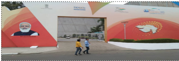
Vibrant Gujarat summit postponed due to Covid-19 surge