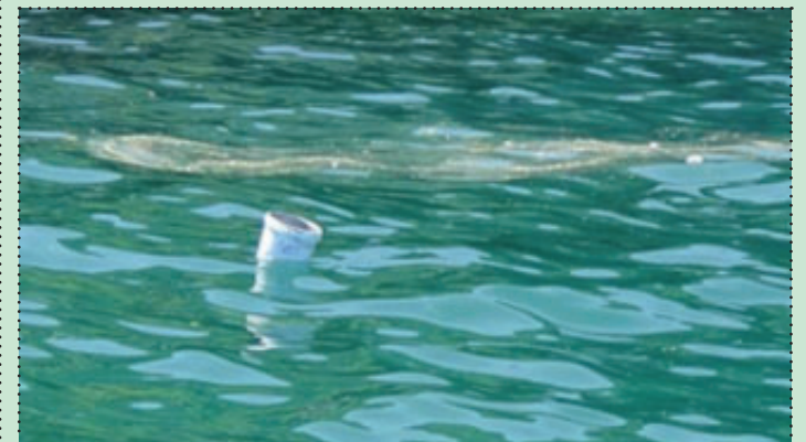
Plastics are a great threat to human health