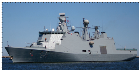
Danish frigate Esbern Snare.

In July 2021, it was reported that a Togolese court had convicted nine men of piracy following an attack on a tanker in May 2019. One of the pirates was sentenced to 15 years in prison while six were each sentenced to 12 years in prison