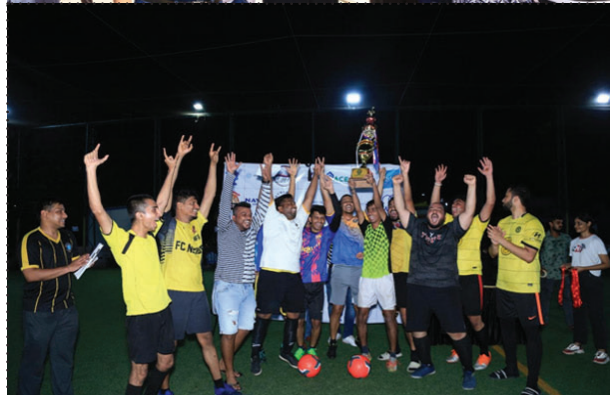
Winner- Anglo Eastern Ship Management

swanky Independence Brewing Company, Powai outlet over mouth-watering snacks and freshly brewed beer. Teams were grouped in 4 heads viz Atlantic, Pacific, Arctic and Indian, through draw of lots. As a first, this year saw the participation of AMET university team which came all the way from Chennai.