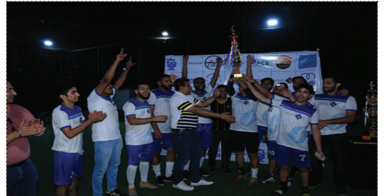
Second Runner Up- Elegant Marine