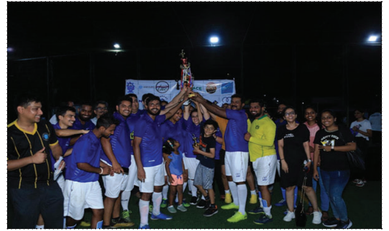
First Runner Up- MMSI

A ‘ Literacy Donation Drive ’ was conducted by the TNC in association with social partner Kia Foundation , an established NGO working for the benefit of rural communities. Companies like Anglo Eastern, MMSI, Great Eastern, MSC, Elegant and others donated stationery in bulk and even old laptops which will be distributed to the less privileged students in rural schools of Maharashtra. A big thank you and shout