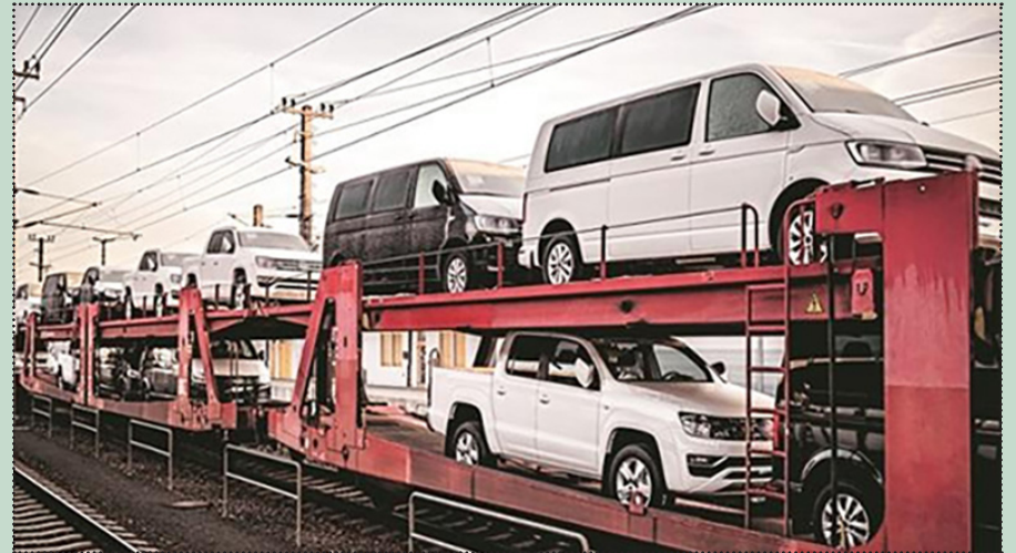
Railways tries to be the preferred transporter of finished goods