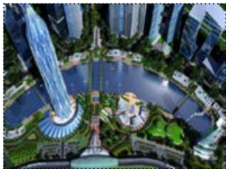
Gift City View

G ujarat Maritime Board (GMB) will be setting up India's first international maritime services cluster at GIFT City. The Maritime Cluster will be developed as a dedicated ecosystem comprising of Ports, Shipping, Logistics services providers and pertinent Government Regulators, all present in the same geographic vicinity (i.e. GIFT City). The cluster will further leverage the proximity and accessibility of these stakeholders to enable a synergetic collaboration.