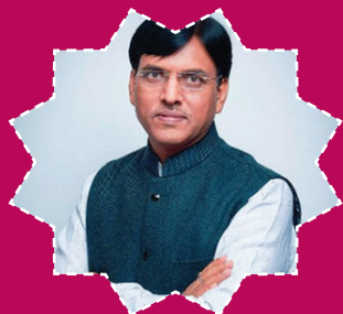
Shipping Minister Mansukh ...