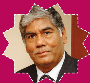
Chairman of Dighi port declared a ...