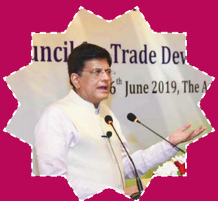
Exporters told not to depend upon ...