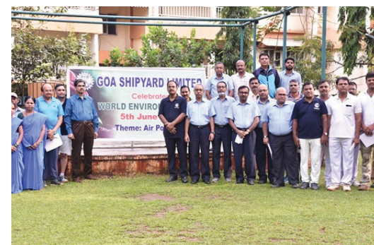
GSL celebrates World Environment Day with Tree plantation

World Environment Day occurs on June 5th every year, is the United Nations's principal vehicle for encouraging worldwide awareness and action for the protection of our environment.