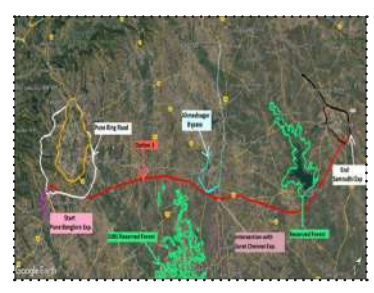
Nagpur to Pune journey will be possible in eight hours.

will make it possible to travel from Pune to ChhatrapatiSambhajinagar (Aurangabad)intwoandhalf hours and from Nagpur to ChhatrapatiSambhajinagar (Aurangabad) in five and half hours through Samruddhi Mahamarg.