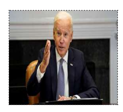
U.S. President Joe Biden

grain exporters, in response to what it called a major Ukrainian drone attack earlier in the day on its fleet near the port of Sevastopol in Russian-annexed Crimea.