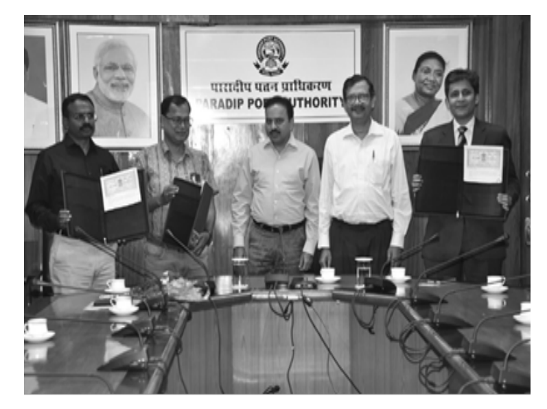
Paradip Port's agreement to transfer Mobile X-Ray Scanner to Customs