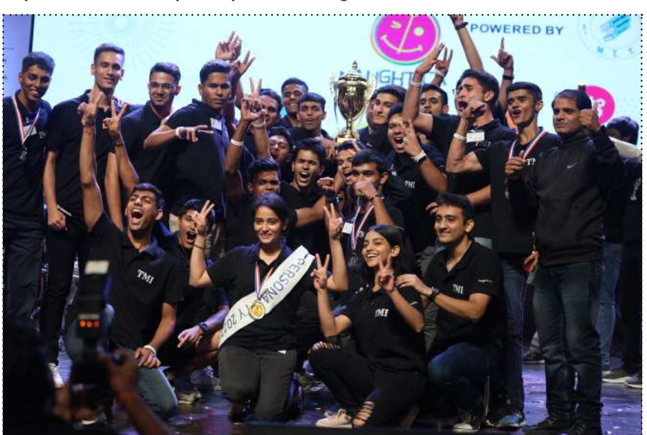
TMI Winner Medals Tally