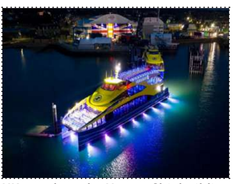
UK to launch Home Shipbuilding Credit Guarantee Scheme

The project is a key deliverable of the National Shipbuilding (NSBS), Strategy launched this year. March flagship deliverables include the establishment of the UK Shipping Office for Reducing Emissions (UKSHORE), thirty-year pipeline for domestic vessel procurement and the Maritime Capability Campaign Office (MCCO). All of which are intended to support the development and growth of the UK shipbuilding, boatbuilding, manufacturing and technology