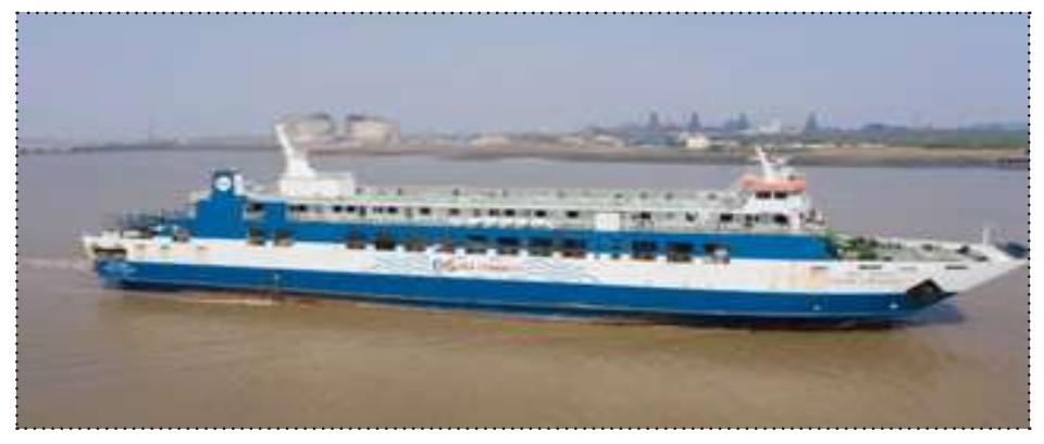
A 200 passenger capacity high speed catamaran is all set to sail three times a day from Nov 1 between domestic cruise terminus adjacent to ferry wharf and mandwa near Alibaug.