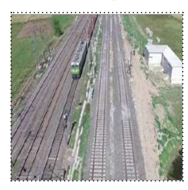
Shift from roads to rail in India has begun.