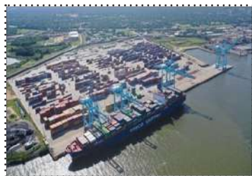
APM Terminals Mobile