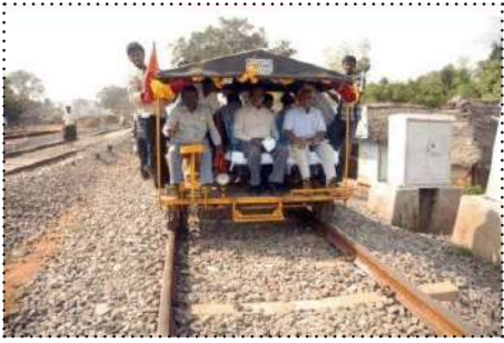
Conversion of meter gauge into broad gauge