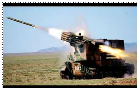
India becoming leading Defence Exporter

India's current approach to India's defence and security cooperation with Africa and other developing countries, which remains need-based and focuses on empowering through training, capacity building, and humanitarian assistance.