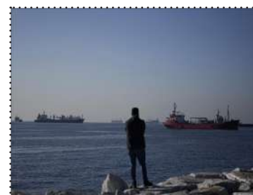
Ships loaded with grain departed Ukraine on November 2

Mr. Putin also said that resuming the grain deal would require an investigation into the attack on Russia's Black Sea fleet,