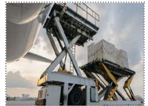
All time high cargo movement at Ahmedabad airport

domestic and an international cargo terminal have come up at SVPI Airport. Bonded trucking, a new cargo service started recently, will also further boost the trade, the statement added.