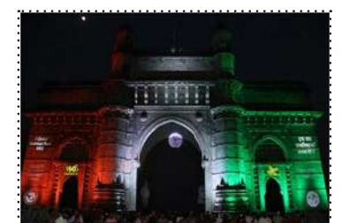
Gateway of India with Vigilance related messages

and solidarity in the fight against corruption. The event was also attended by Chief Vigilance Officers of different organisations, said a release.