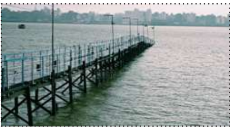
Jetty on the Ganges