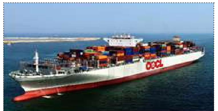
The new service will connect the ports of NhavaSheva and Mundra in India

The new service will connect the ports of NhavaSheva and Mundra in India, Jebel Ali and Khalifa in UAE, Mombasa in Kenya, and Dar Es Salam in Tanzania.