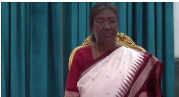
The President of India, Smt. Droupadi Murmu