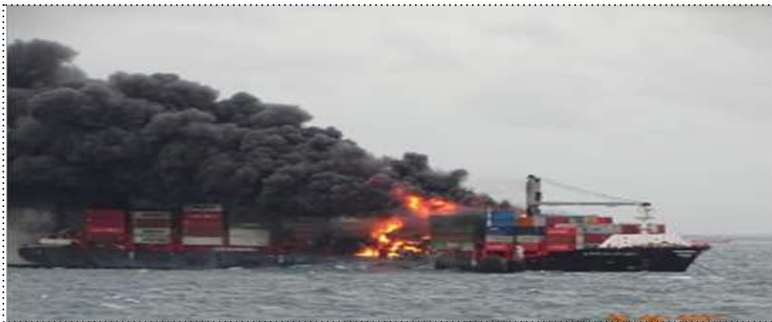
TT is once more urging a more comprehensive approach to arresting the trend.