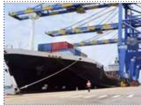
The Chittagong port is very congested, a special space will help smooth movement of goods says the Minister.

Later, speaking to PTI, he said that as the Chittagong port is very