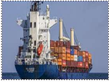
India Inc gets a relief with international freight rates decline