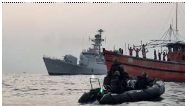
Coastal Defense Exercise Sea Vigil 22

The exercise involved participation of more than 17 Government agencies from nine Coastal States and four Union Territories that are