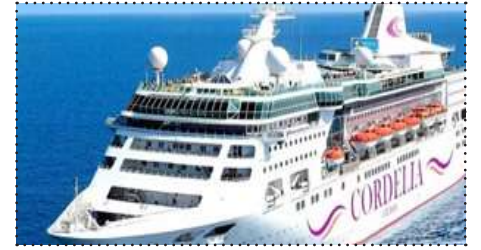
International Cruise Liner

made arrangements to welcome the travellers of the first cruise liner of the season. Tourists taxis from the port town operated by locals have also geared up for the season. Most cruise liners usually make a