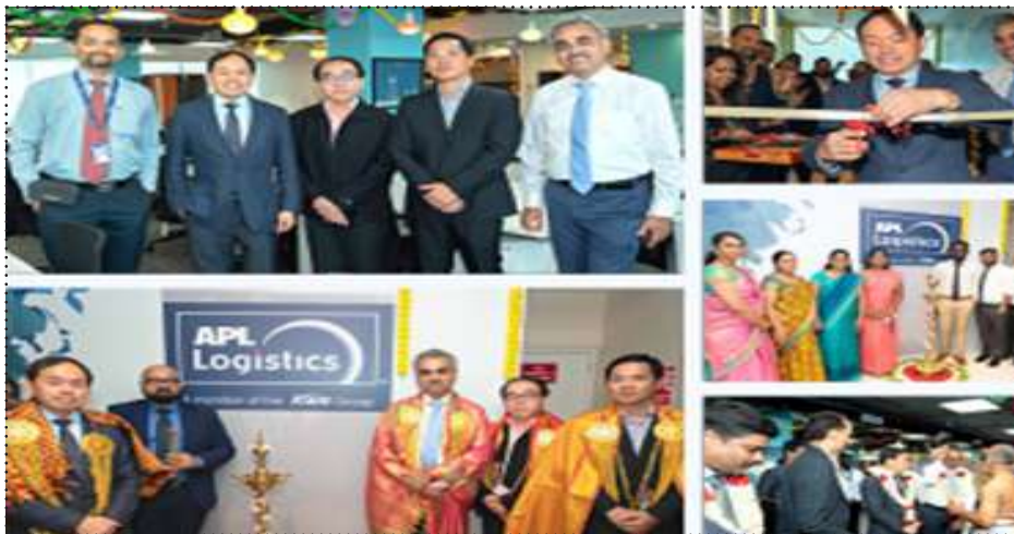
APL Logistics inauguration at Chennai