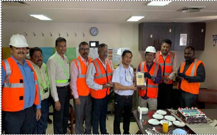
Officials of VOCPA, DBGT, Agents of Wanhai and IAL and Master of the Vessel (fourth from Right)