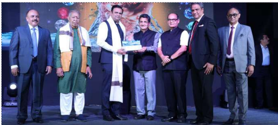
Shri Rahul Narvekar being honored