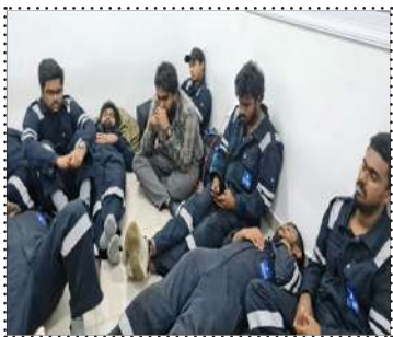
Crew of the Heroic Idun in custody in Equatorial Guinea.