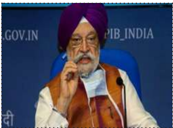
Oil minister Hardeep Singh Puri