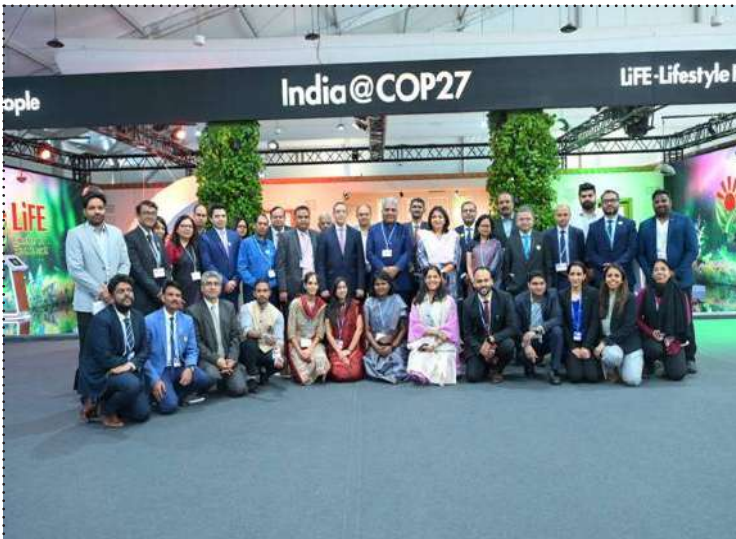
The pavilion was inaugurated on 6th November by Minister of Environment, Forest and Climate Change