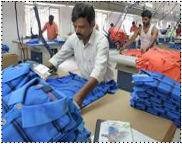
Tiruppur exporters face dip in exports for the past three months