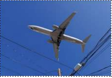
Levy on scheduled domestic flights to be increased from Jan 1

The Union government has announced that Regional Air Connectivity levy charged from commercial airlines under the UDAN scheme will be increased to Rs10,000 per departure from January 1, a move that aviation experts said could push the airfares higher.