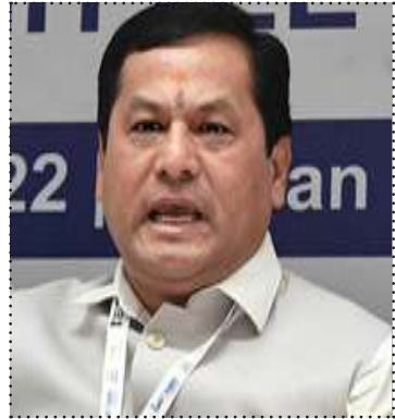
Sarbananda Sonowal, Minister for Ports, Shipping and Waterways

NEW DELHI Sagar Sandesh News Service India, which is eyeing Cochin port as a possible trans-shipment hub and an alternative to Sri Lanka's Colombo port, will invest over ₹380 crore towards deepen draft depth at the port to 16 metres. Additional investment to raise capacity of the international trans-shipment terminal to 2 million TEUs, is also being