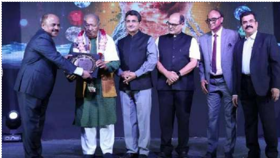
Shri Hari Prasad Chaurasiya being honoured

The 9th International Samudra Manthan Awards 2022 concluded in Mumbai on 11th November 2022 with great energy, enthusiasm, excitement and wholehearted participation from