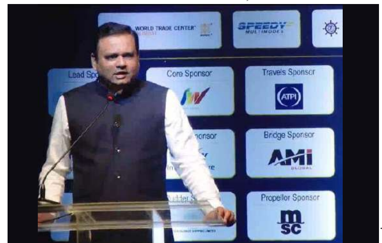
Shri Rahul Narvekar Speaker of Maharashtra Legislative Assembly addressing audience