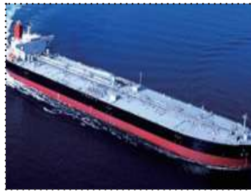
Values for five year old VLCCs are currently at the highest levels since 2009.

Values for Bulkers have fallen across all size and age ranges since the start of the year. In the Capesize