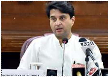
Minister Jyotiraditya Scindia