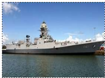
Second Project 15B guided missile destroyer delivered to Indian Navy