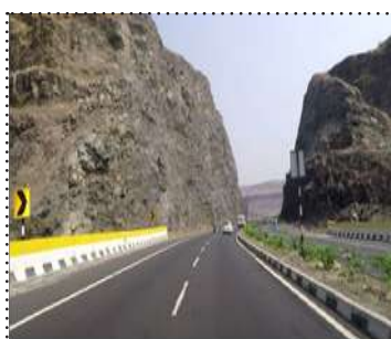
The widening of the NH-163 on the Hyderabad-Bhupalapatnam stretch.

Gadkari said rehabilitation and upgradation to 2/4 lane with paved shoulders on NH-167K including the approaches of Iconic Bridge across river Krishna in Nagarkurnool district in Telangana and