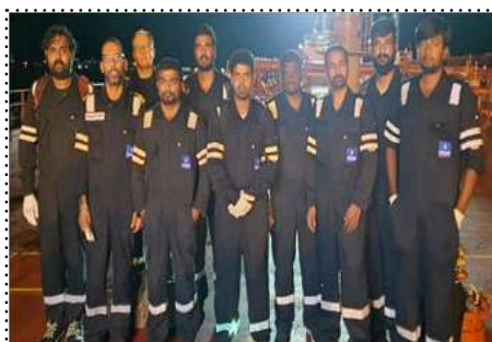
Heroic Idun seafarers

The seafarers are currently being held in Nigeria and face charges for alleged involvement in oil theft and 'faking' a piracy attack in breach of the Suppression of Piracy and Other Maritime Offences Act. However, the ships owners have confirmed that there has been no unlawful activity.