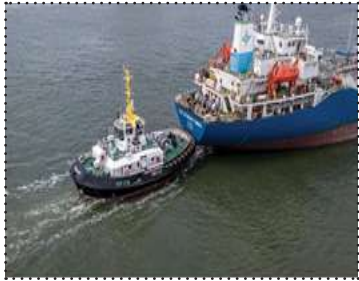
Tugboat to be outsourced govt mulling