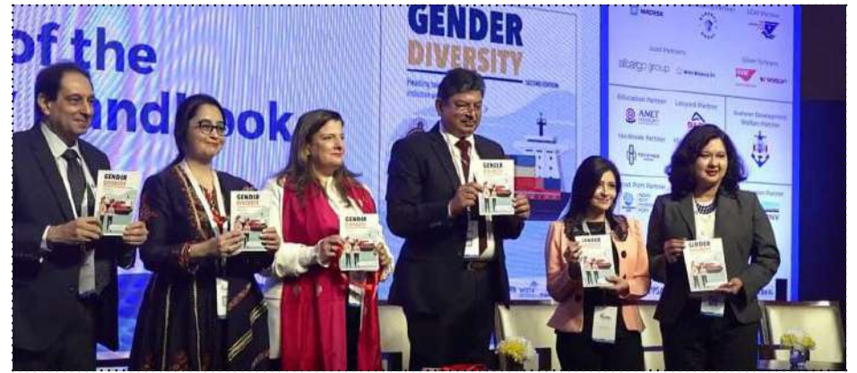
Release of Gender Diversity Handbook