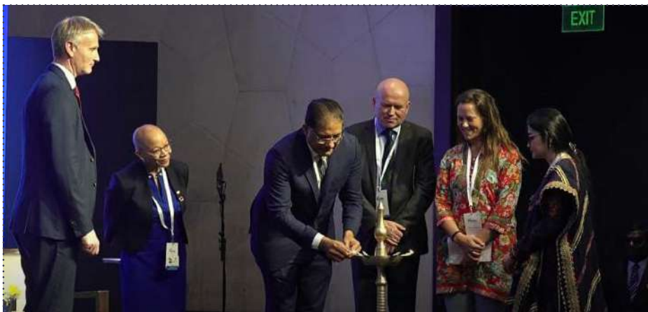
Lighting of Lamp

conference was hybrid and with a physical event at Taj Hotel in Mumbai – India, where over 200 people attended, and more than 2000 attended and followed it virtually, the biggest of its nature and one of the biggest events on Diversity & Sustainability of the year!