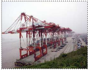
Port of Shanghai