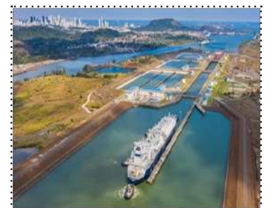
Additional marine trade route

The creation of the Green Shipping Corridor comes at the time when the Green Shipping Challenge is launched at COP27 and the United States has committed to leading the transition to zero-emission