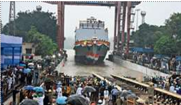
Garden Reach Shipbuilders