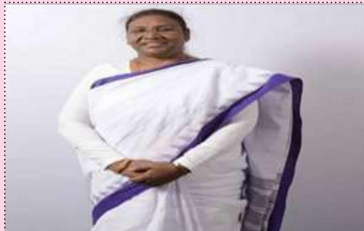
President Smt Droupadi Murmu