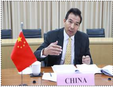
Luo Zhaohui, the former Vice Foreign Minister and Ambassador to India.