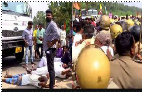
Protests against Vizhinjam

TIRUVANANTHAPURAM Sagar Sandesh News Service