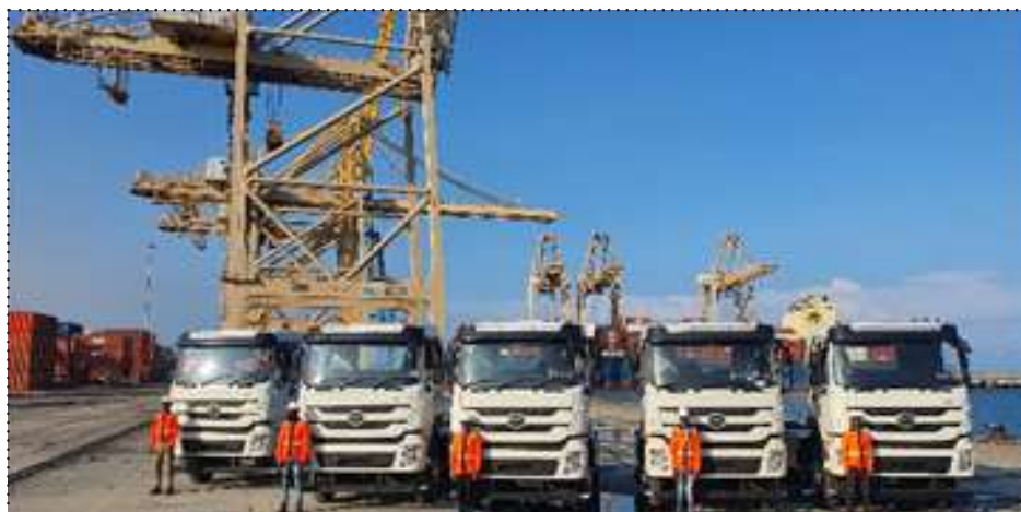
Kattupalli port to replace diesel internal vehicles with electric ones.