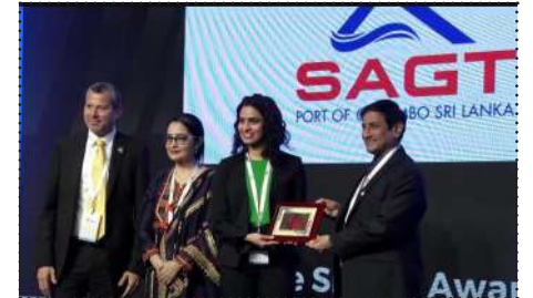
SAGT-Best Company with Sustainable Practices Award