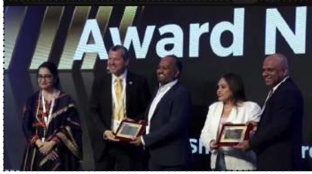
Entrepreneur of the Year Award