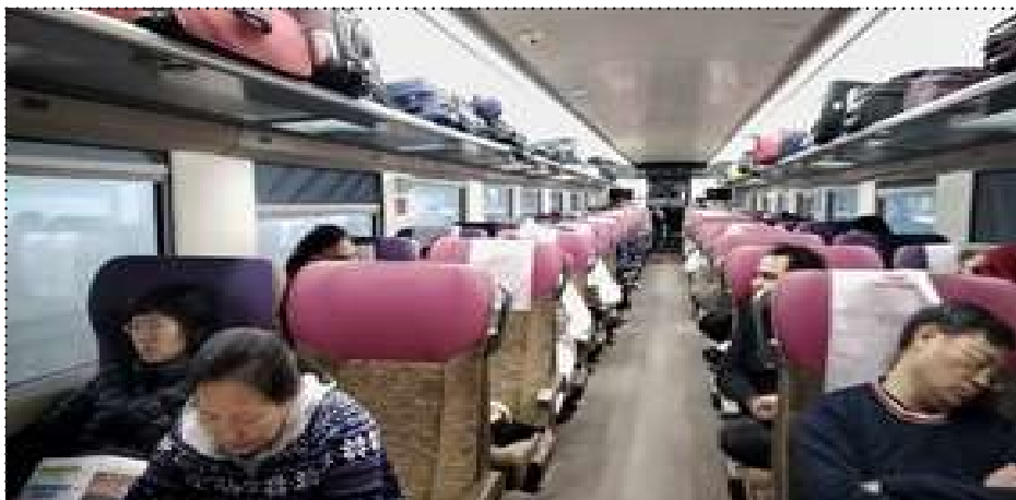
Interior of Vande Bharat train

TIRUVANANTHAPURAM Sagar Sandesh News Service