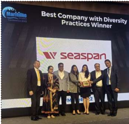
Seaspan-Best Company with Diversity Practices Award