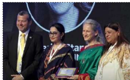
SheEO Leads Award