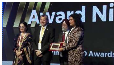
TradeWinds-Media Company of the Year Award