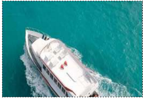
Existing two Ro-Ros out of service leaving people stranded