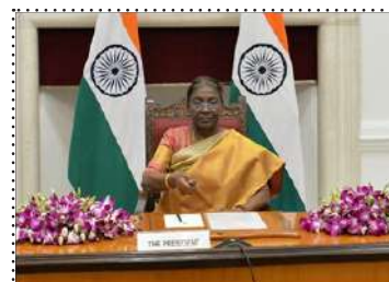
President Droupadi Murmu

Defense Minister Rajnath Singh, Governor Biswabhusan Harichandan