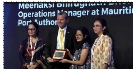
Brilliant SheEO Award (collected on behalf)