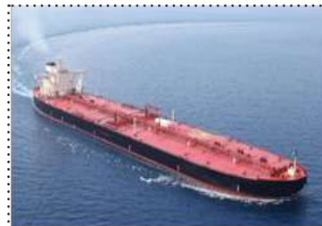
Chinese diesel vessel arrives at Colombo

Chinese Oil tanker "Super Eastern" carrying 10.6 million liters (9,000 tons) of diesel donated by Beijing to Sri Lankan farmers and fishermen has left Singapore and has berthed at the Colombo Port on November 26th