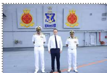
French Minister's visit to INS Vikrant

their country's minister for Armed Forces Mr. Sébastien Lecornu, visited the Indigenous Aircraft Carrier INS Vikrant.