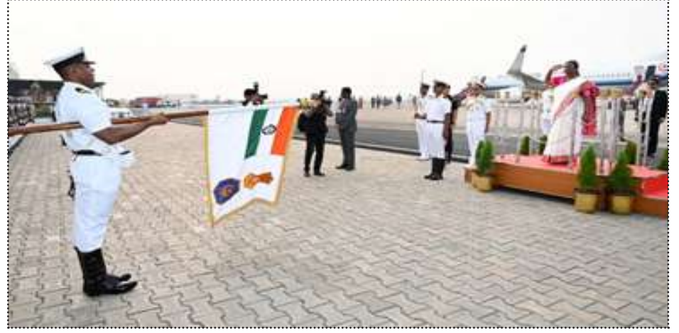
The Hon’ble President of India has approved introduction of a new design for the President’s Standard and Colour and Indian Navy Crest for the Indian Navy, which were unveiled at Visakhapatnam on Navy Day on 04 Dec 2022.

The President’s Standard and President’s Colour are awarded to static and mobile formations of