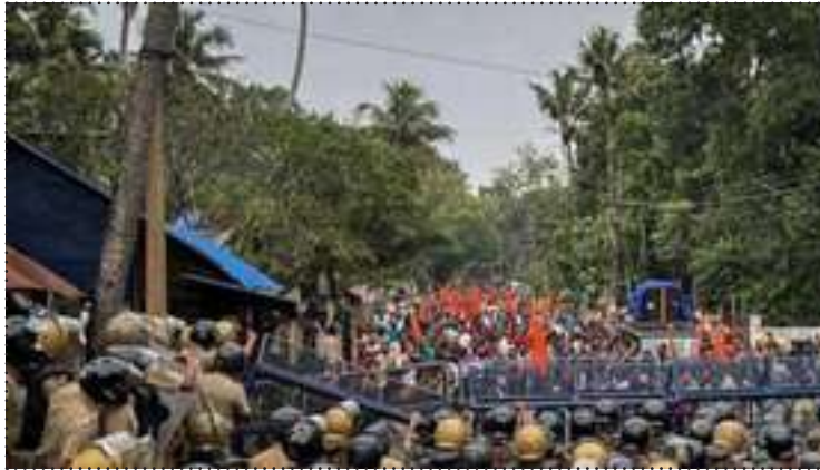
Police officers stand guard near the barricades during a protest rally by the supporters of the proposed Vizhinjam port project in the southern state of Kerala.

Kerala Ports Minister Ahammed Devarkovil was of the view that Adani Group, which is carrying out the port construction, can seek protection from central forces at the work site, but outside it,