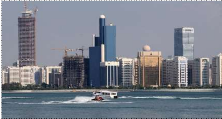
A general view of the Abu Dhabi skyline.

Abu Dhabi has identified priority sectors including agritech, tourism, healthcare, pharma and financial