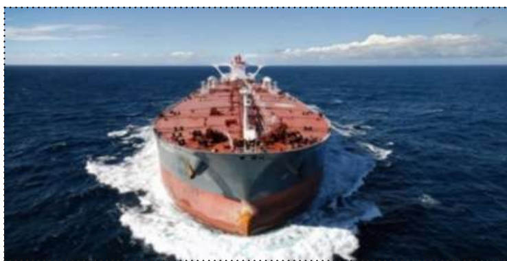
Everything is due to be finalized with everyone closely watching for the publication of the official procedures.

The Czech Presidency of the Council of the European