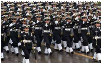
Women sailors; historic first induction.