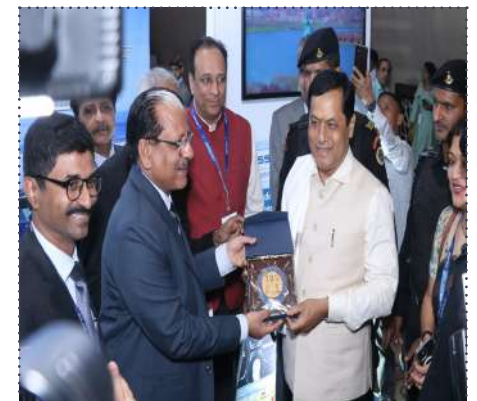
Shri Sarbananda Sonowal, Hon'ble Minister of Ports Shipping &amp; Waterways visit IRS stand

Covering a wide range of shipping, offshore and industrial projects, their team of dedicated professionals brings international standardisation and assurance to your doorstep. visit: http://www.irclass.org