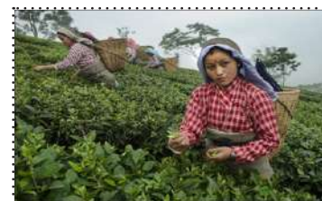
Darjeeling tea gardens

Besides Iraq, shipments to another major buyer Iran are also suffering due to economic sanctions imposed by the US and also because the Iranian importers are not lifting the commodity due to non-issuance of invoices to the Indian exporters. Exports to the CIS are also in limbo due to