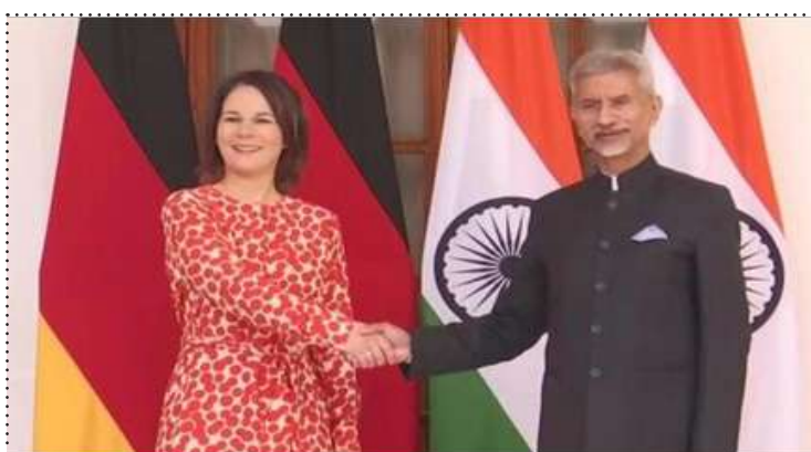
Germany's foreign minister Annalena Baerbock with EAM Jaishankar

Germany has described India as its Natural