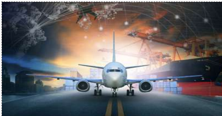
The PCS functionality will now be a part of the NLP-Marine platform

The national single window platform will be the first of its kind to provide B2B (Business to Business) and B2G (Business to Government) services for marine trade stakeholders. The platform seeks to help exporters, importers, and service providers exchange documents seamlessly