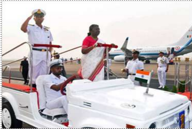
President Droupadi Murmu at Navy day function

Speaking on the occasion, the President congratulated all officers and men and their families on the Navy Day. She said that we celebrate this