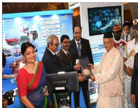
Shri Bhagat Singh Koshyari, Hon'ble Governor of Maharashtra visit IRS stand

With the event theme focussing on 'Evolving Maritime World for Greener & Sustainable Future' decarbonization was high on the agenda and several deliberations focussed on the roadmap in achieving IMO strategy/goals.