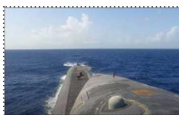
The US Navy "secretly" sent a submarine to the island of Diego Garcia in the Indian Ocean

The Navy, in its message, revealed the USS West Virginia's docking in the Indian Ocean and its visit to the port. When Navy submarines are in the sea, their specific movements remain