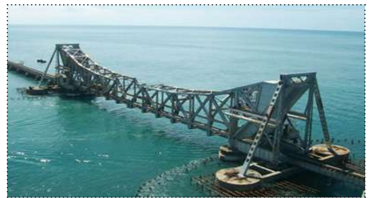
The 2.07 km long Pamban Rail Sea Bridge in Tamil Nadu

The old bridge using the Scherzer rolling lift technology that is manually operated and opens horizontally to let the ships pass through. Ships moving from north to south Tamil nadu coast and vice versa have to wait for days together for the lift to be operated by the railways leading to indefinite delays.