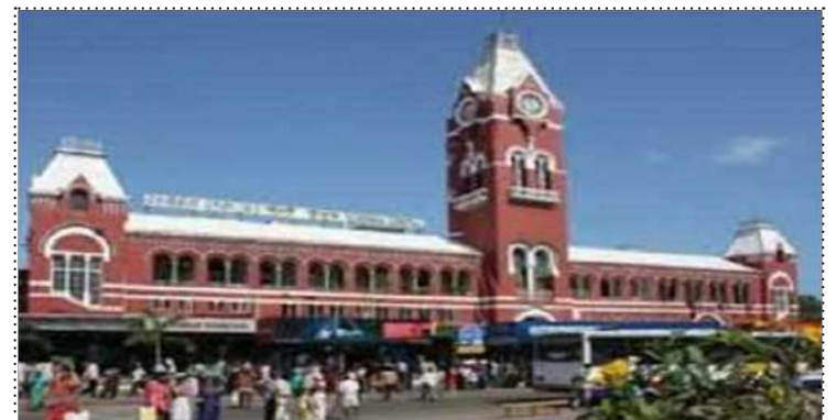
Chennai Central Railway station

With this, the Southern Railway has so far awarded tenders for redevelopment of Nine Railway stations. These include three stations in Kerala - Ernakulam Junction, Ernakulam Town and Kollam; five in Tamil Nadu - Chennai Egmore, Katpadi Junction, Madurai Junction, Rameswaram and One in Puducherry - Puducherry. The Southern Railway has also undertaken feasibility study for preparation of Detailed Project Report (DPR) for four stations - Chengannur and Thrissur in Kerala and Kumbakonam and