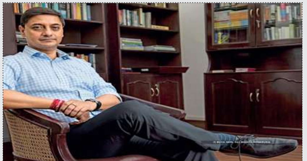
Mr Sanjeev Sanyal, Member, PM Economic Advisory Council

Particularly for the Global South, sustaining a high GDP growth rate is critical to achieving SDGs; without that, countries will be re-distributing poverty, he added, as per a report.