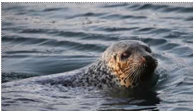
About 2,500 dead seals appeared on the Russian coast

Initial reports had said that 700 dead seals had been found on the coast. However, after further investigation, the Russian ministry of natural